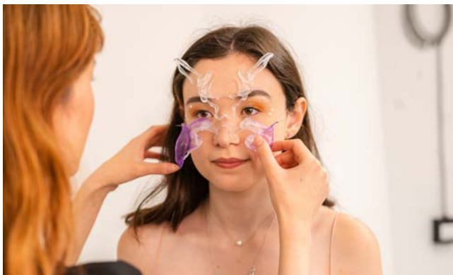
Figure 6: Application of the nosepiece and circuit.

On-Face Application: To apply Social Prosthesis to the face, we used 3rd Degree Silicone (Alcone Company), a fast-curing two-part silicone modeling compound, to adhere the resin prosthetic to the face. 3rd Degree parts A and B were mixed and applied as a thick layer to the back of the prosthetic on the areas that contact the forehead. Then, the prosthetic was positioned on the face for five minutes as the 3rd Degree cured. For extra security, the nosepiece uses an elastic string to loop around the head. The circuit can be tucked over the ears and hidden behind the head or hair, as shown in Figure 1. Social Prosthesis was designed to balance and sit on the contours of the face and uses theatrical quality silicone adhesive meant for gluing prosthetics so that once adhered, the pieces will remain secure for at least two hours with normal movement and wear, and no extreme changes to body temperature or surroundings.