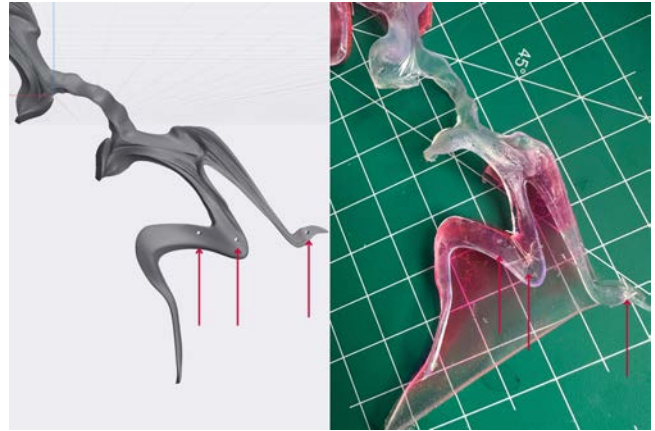
Figure 3: A 3D render and image of the nosepiece 3D design, with arrows pointing to the holes in the structure for securing the silicone.

Coloring Resin and Silicone: Since Social Prosthesis's design aims to explore expression past the typical usage of prosthetic makeup, we decided to utilize clear and transparent materials in