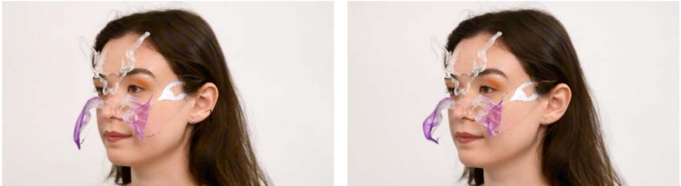
Figure 1: A model wearing the Social Prosthesis headpiece, nosepiece, and touch-sensing temporary tattoo. When the temporary tattoo is triggered through touch contact, the nose-piece starts curling in reaction.

Hsin-Liu (Cindy) Kao Hybrid Body Lab, Cornell University Ithaca, USA cindykao@cornell.edu