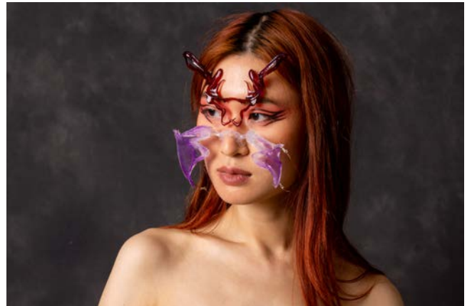
Figure 4: A model wearing a red Social Prosthesis headpiece with a clear nosepiece to demonstrate the possibility of different colorways.

order to augment the aesthetic appeal of the design. To create a variety of colorway options for the facial pieces, as shown in Figure 4, we used alcohol ink mixed with 99% isopropyl alcohol after printing. This post-production method allows for extra flexibility in color choices instead of producing pieces in the identical color of the resin cartridge. We coated the resin prints with Art Resin, a two-part epoxy that creates a high-shine gloss coat. To create a gradient in the silicone, we mixed a pinprick of purple silicone pigment into uncured EcoFlex Near Clear and then gradually added this colorful mixture to one side of the mold. The blended gradient in the silicone showcases the rigid structure underneath.