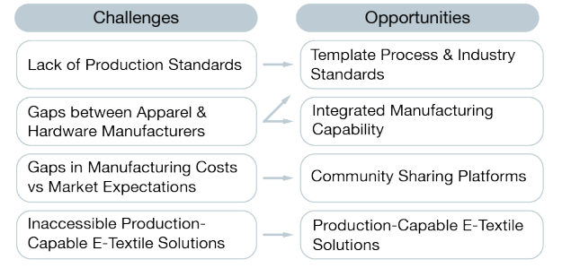
Figure 2: Mapping of "Challenges" to "Opportunities for Improvement" in e-textile production.

Reflecting on the interview findings, we distill the following opportunities for improving low-volume e-textile production (Figure 2).